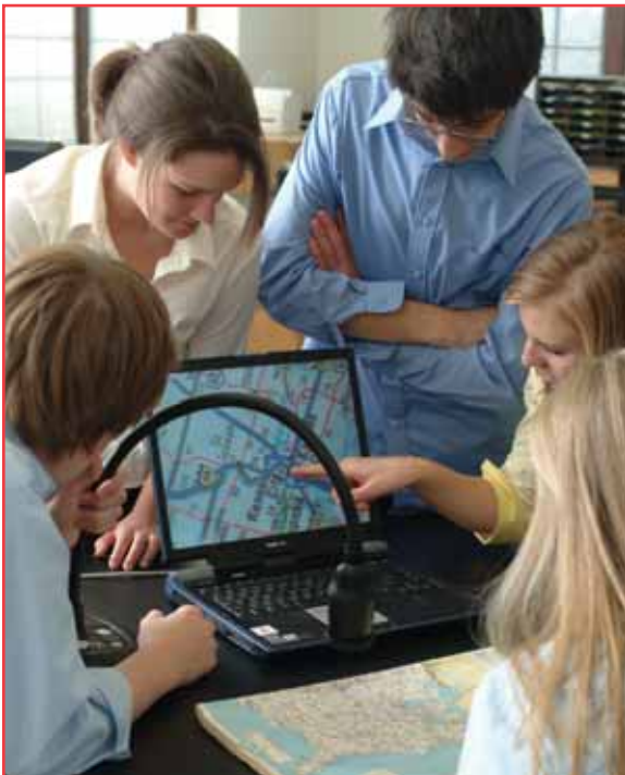
Students using the Video Flex to view a Map