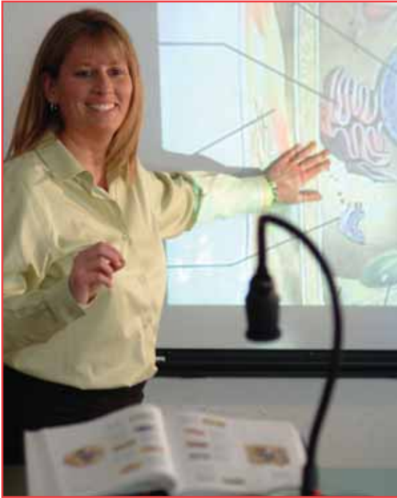
Teacher using the Video Flex